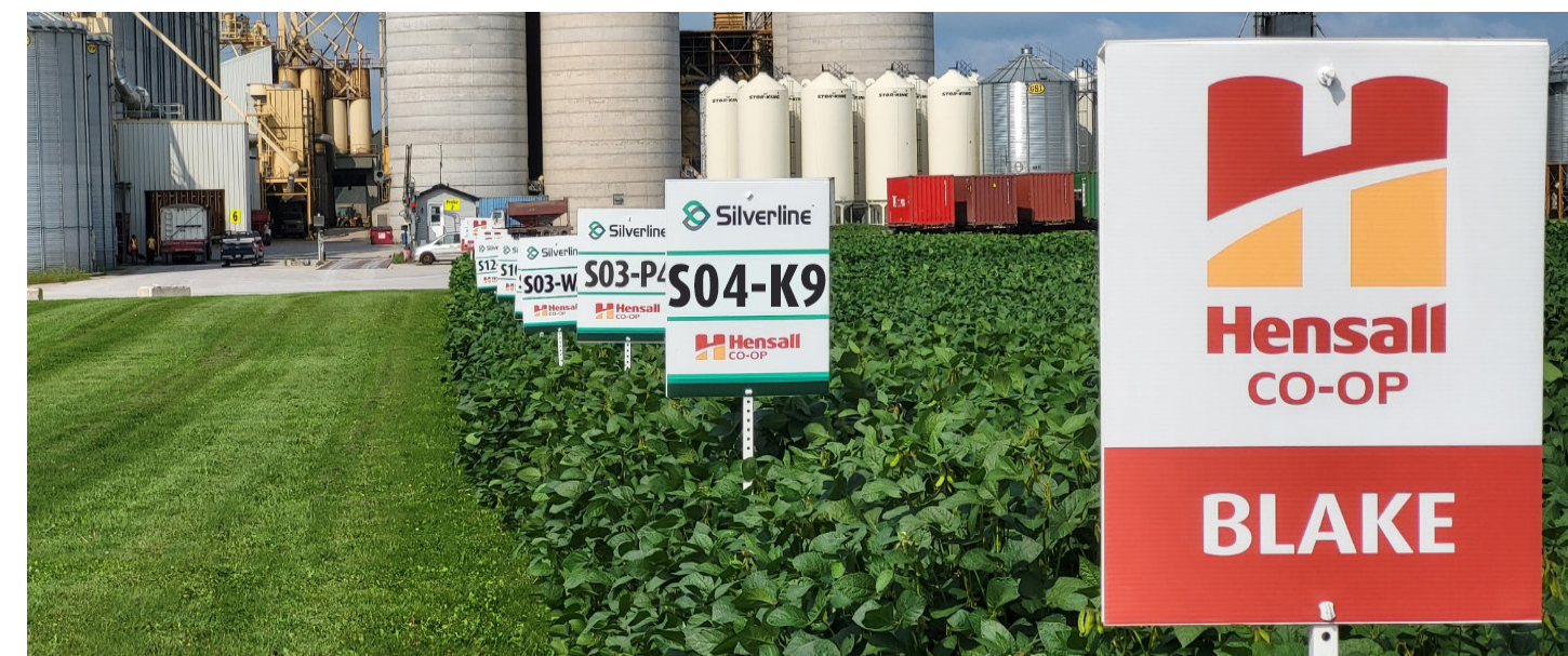
Always read and follow label and bag tag instructions. Silverline™ and Design™ are trademarks of a Syngenta Group Company. © 2023 Syngenta.

Edible beans and food-grade soybeans are supplied to buyers on a global scale, and we remain committed to being a reliable partner for existing customers while fostering new relationships. The food-grade crops we provide play a role in meals served to families worldwide, and Hensall Co-op extends its gratitude to everyone working with us to ensure a consistent, safe, and traceable food product year after year.